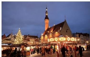
Christmas Market and the Town Hall Tower

Which symbol of the city of Tallinn can you spot on the Town Hall Tower? * 0 Punkte