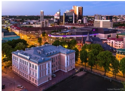
The school and the "skyscrapers" of Tallinn.

When was the school, where the EC Expo will take the place, established? * 0 Punkte