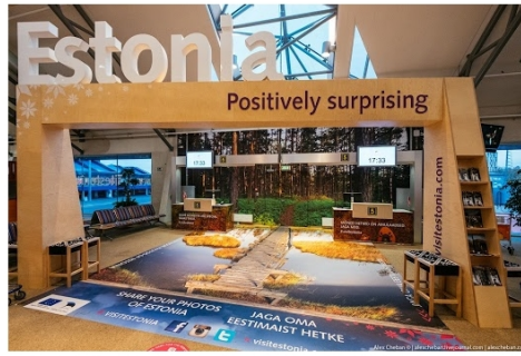
Gates in Tallinn Airport.